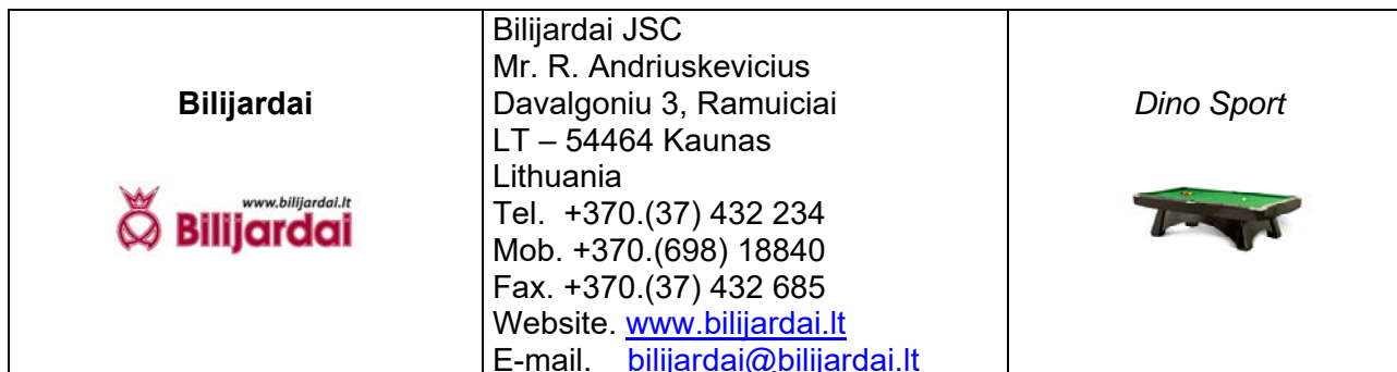
Table Recognized Type B by the EPBF